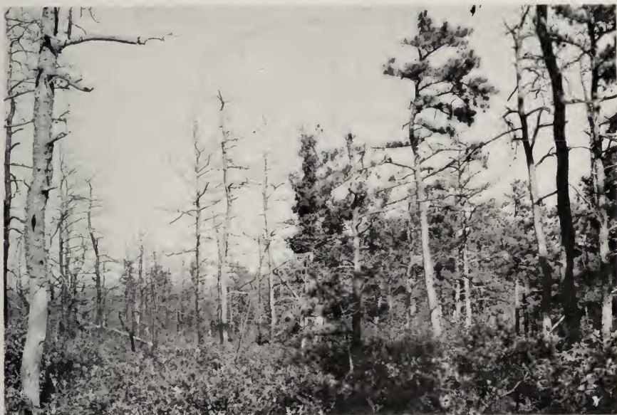
FIG. 3. The edge between recently burned forest (shown in Fig. 2) and more mature forest (ca. 25 years after the most recent fire).

gun (Nolan 1978). On 11 May I estimated that 30–35 males were singing in REGN; many seemed to be individuals that had first been seen on 6 May and had occupied the same locations every day since. By 13 May I estimated 20–25 singing males, a figure which approximated the final breeding density (see below).